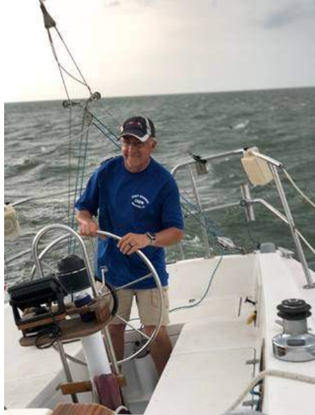
Grinning with Wind in the Sails