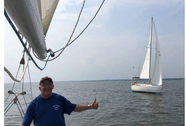
Risky Business Passing Knot Normal 2. WHAT??

Come out and enjoy Friday Night Sailing! See you on the water.