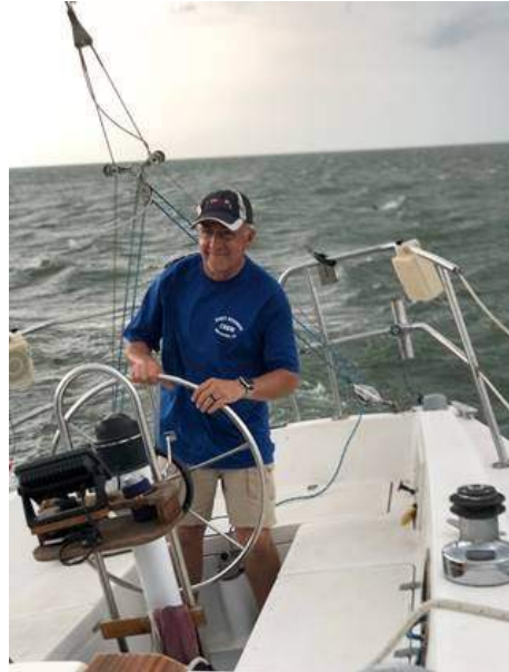
Grinning with Wind in the Sails