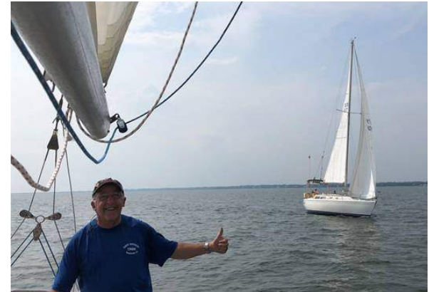
Risky Business Passing Knot Normal 2. WHAT??

Come out and enjoy Friday Night Sailing! See you on the water.