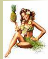
How Low can you Go!!