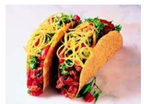
Thursdays - 50c Tacos!! Bring the kids.