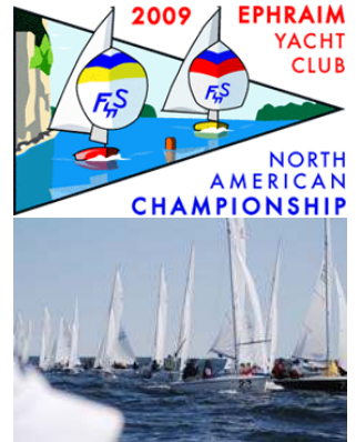
See more Championship photos at www.eyc.org