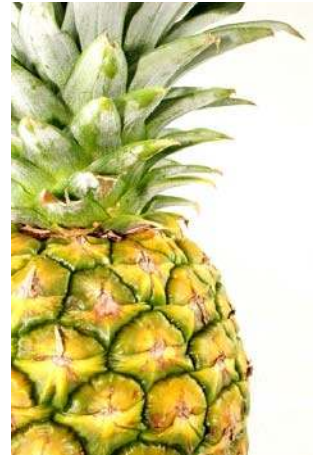
Mark your Calendars for Caribe Party August 22nd! Get ready for yummy tropical concoctions!

Don't forget every Wednesday is Dog Night and Thursday 50c tacos.