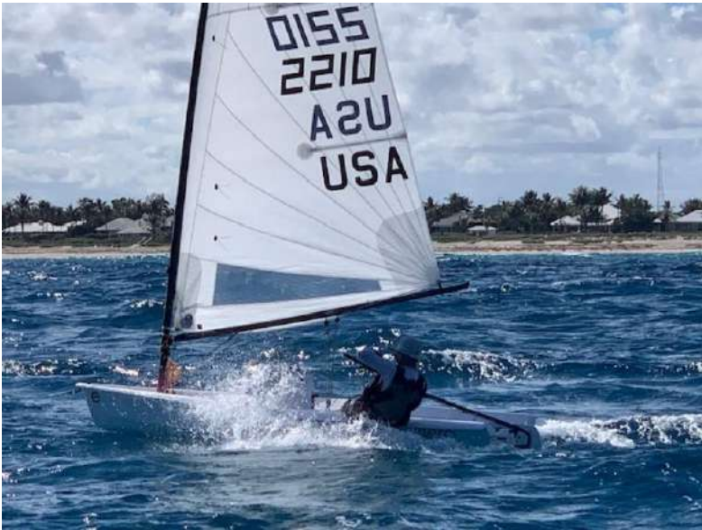
RS Aero North American Midwinters at Palm Beach Sailing Club

Next up on the US Winter Series is another set of back to back weekends in March at Port Canaveral on 8-10th and then Sarasota on 14-17th, ideal for the long distance travellers looking for good racing and winter sun! Full event details and info on Charter RS Aeros are on the RS Aero North American Events List here and you can keep in touch with Everything Aero via the RS Aero North American Facebook Group .